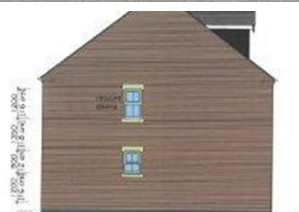
Side Elevation SCALE 1:50