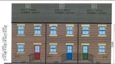
Front Elevation SCALE 1:50